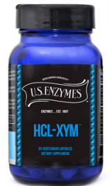
2 HCL-XYM after meals