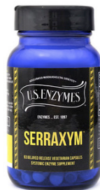
6 Serraxym per day