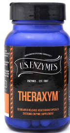
6 Theraxym per day