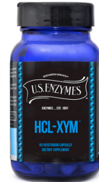
2 HCL-XYM after meals