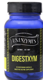
1 Digestxym per meal