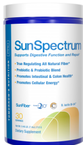
1 scoop per day