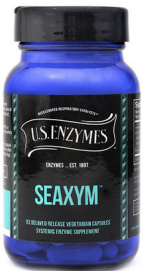
6 Seaxym per day