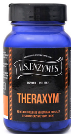
6 Theraxym per day