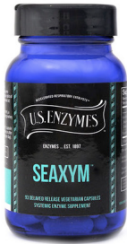
6 Seaxym per day